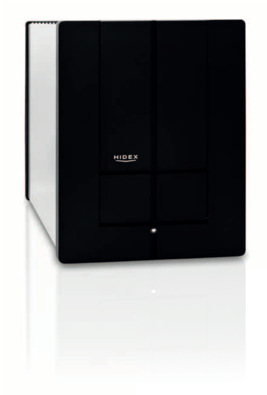
Hidex Sense Microplate Reader